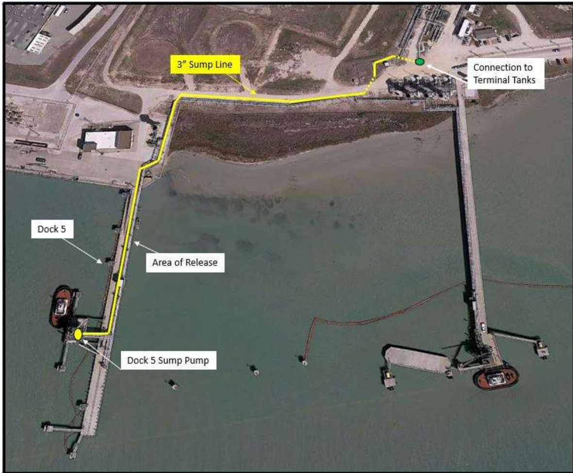
Photograph 1: Flint Hills Resources Ingleside terminal sump line location.