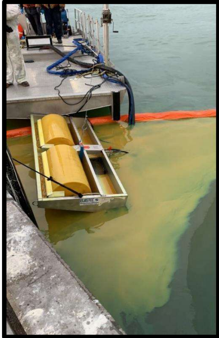
Photograph 2: Drum skimmer removing product from the surface of the water near Dock 5.