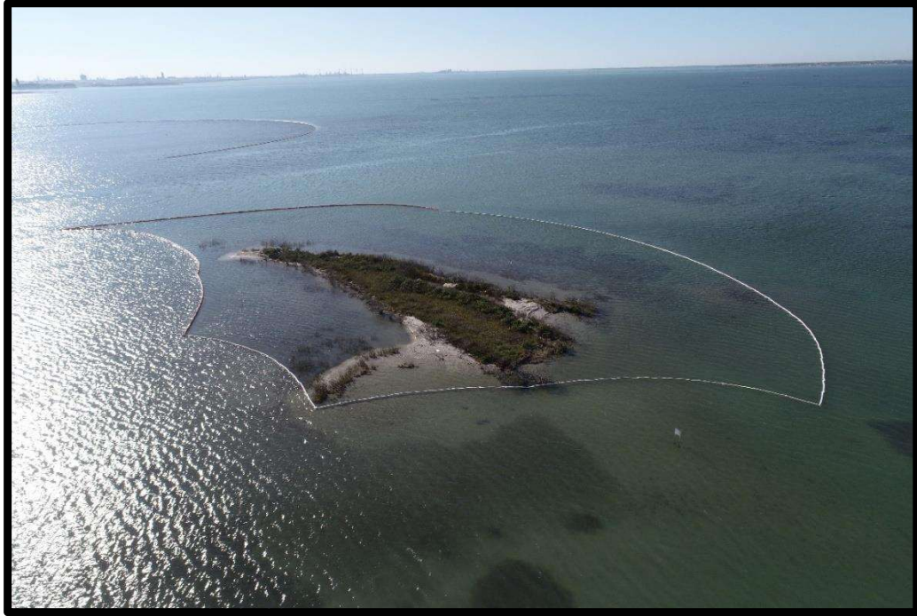
Photograph 6: Protective boom surrounding habitat area.