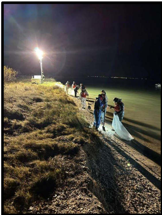
Photograph 3: Emergency response crew responding during night hours, with the use of a portable light plant, performing shoreline reconnaissance and cleanup.